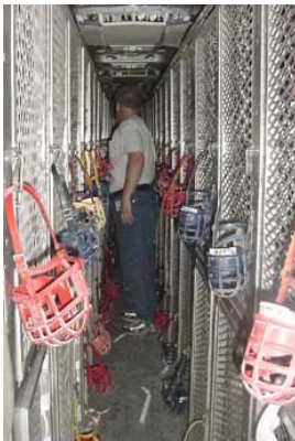
Loading the dogs for their long trip.

Well, yes, rest . . . but later - there was still paper work to do. Not only was there a list of all the dogs, there was a separate envelope Tysh had prepared for each dog and there was a separate list of which groups were taking which dogs (eleven groups beside GALT). There were, therefore, 12 large envelopes, each one containing a letter from GALT and in the individual dog's envelope all of the papers received on the dogs going to that particular group with a list of the dogs to be received by the group on the front of the large envelope. Suzanne and Susie also wrote on the front of each dog's envelope any additional information that was known about that dog, such as "very shy - needs extra care" or "very friendly" or "Frontlined 4/21/03." Okay, now after midnight, some rest.