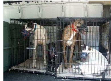
Ready to hit the road

happy to show it to you while bringing your group a load of our lovely panhandle Greys!