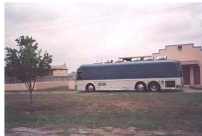
Ready to depart on the first leg of their journey to their forever homes.

Roger called periodically with updates on the progress of the trip. The dogs arrived in Cameron safely and on time. They arrived in Abilene just after 9:00 a.m. on Wednesday with all the dogs in good condition.